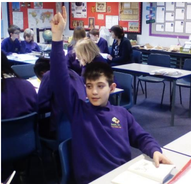
Contributing and answering questions