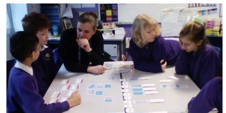
Trying your best and not giving up